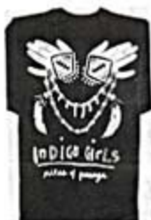
Color: Red, white & blue on black. * Also in child's size 10: $14.00 Code: TSPF..$16.00