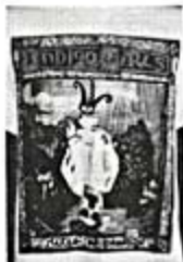
Color: Multi on white. Code: TSYC..... $16.00