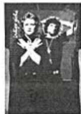
Color: Black. Code: TSPF..$16.00