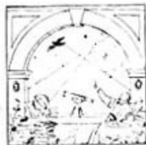
INDIGO GIRLS MCMXCVII